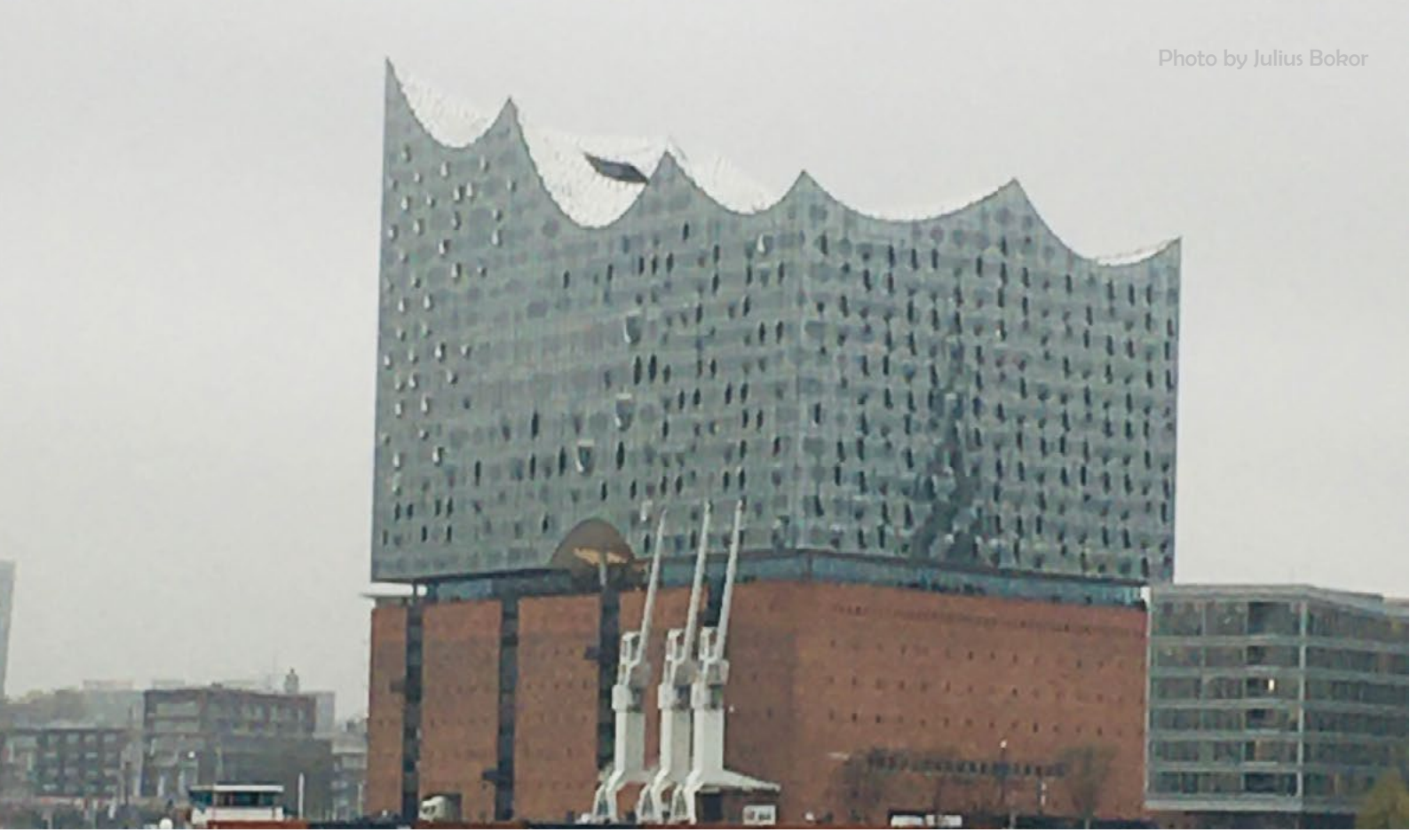
Elbphil from the Harbour.