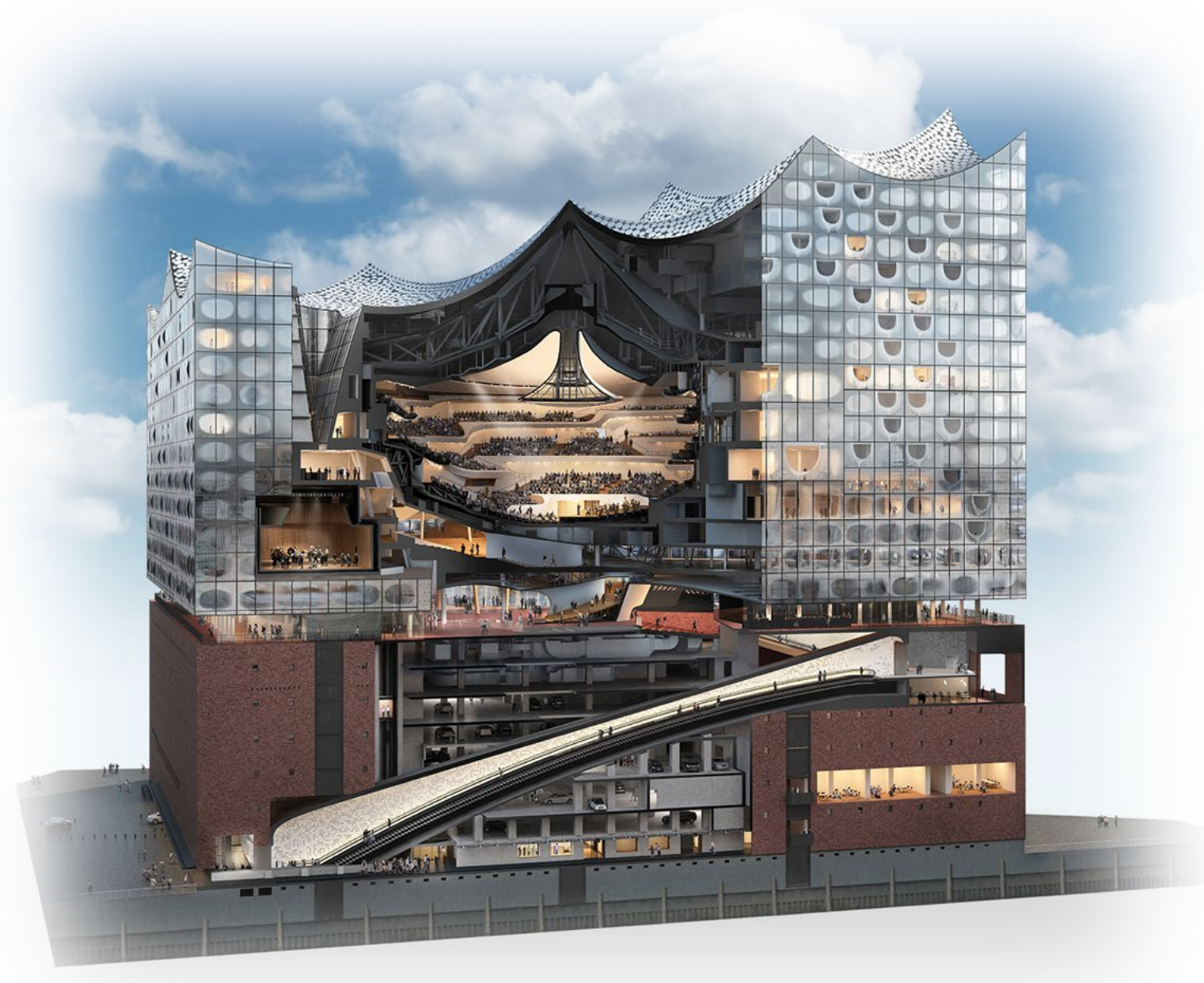
Elbphilharmonie - Cross Section by House Infographics