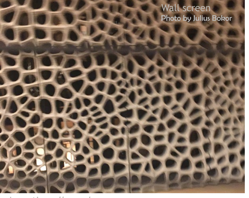
Acoustic wall panels